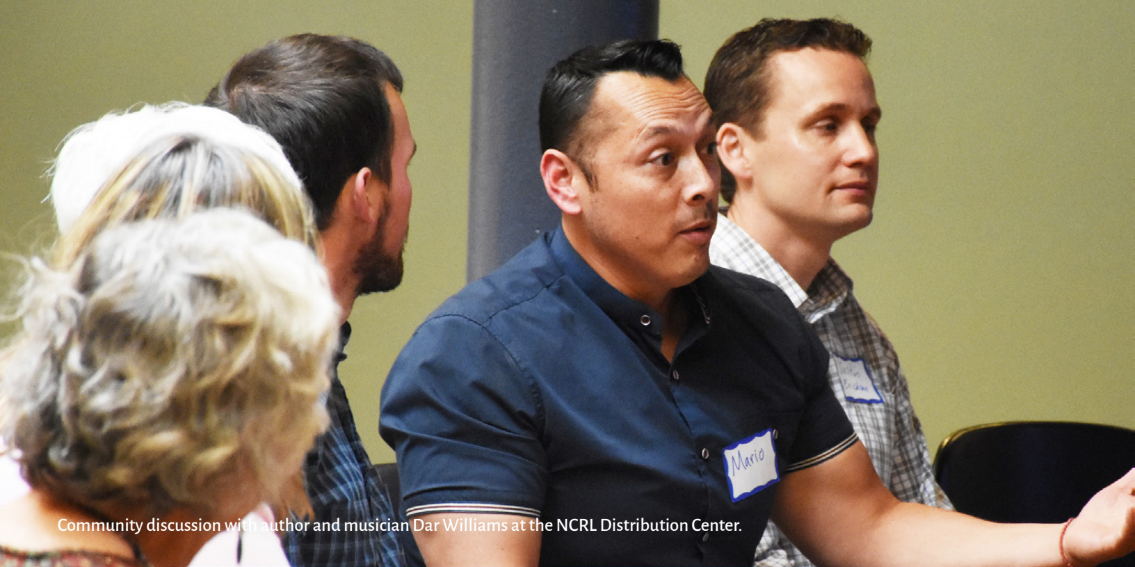
Community discussion with author and musician Dar Williams at the NCRL Distribution Center.