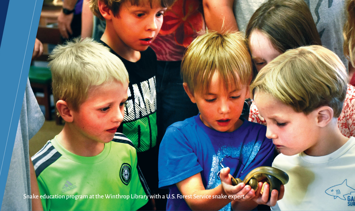
Snake education program at the Winthrop Library with a U.S. Forest Service snake expert.