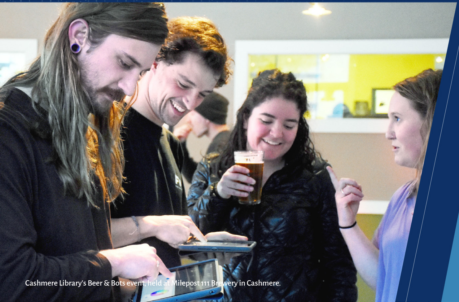
Cashmere Library's Beer & Bots event, held at Milepost 111 Brewery in Cashmere.

Connecting the people of North Central Washington to vital resources and opportunities that foster individual growth and strengthen communities.